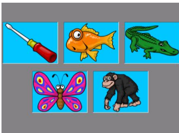
Figure 1. Picture Vocabulary Task

Children aged 7 or above will complete the Link Word task (See Figure 2). In this task two pictures are presented on the screen and separated by six words. The child's task is to identify the word that provides the best conceptual link between the two pictures. If the child wishes, the computer will speak the words when they are clicked on, so reading competence is not necessary.