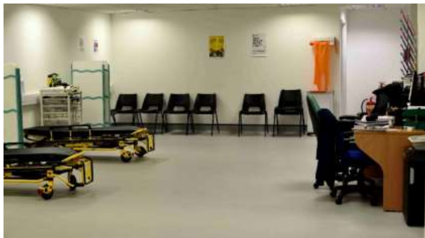
Inside the Cardiff Alcohol Treatment Centre

to contribute questions at appropriate points about how the different strands of the research are progressing.