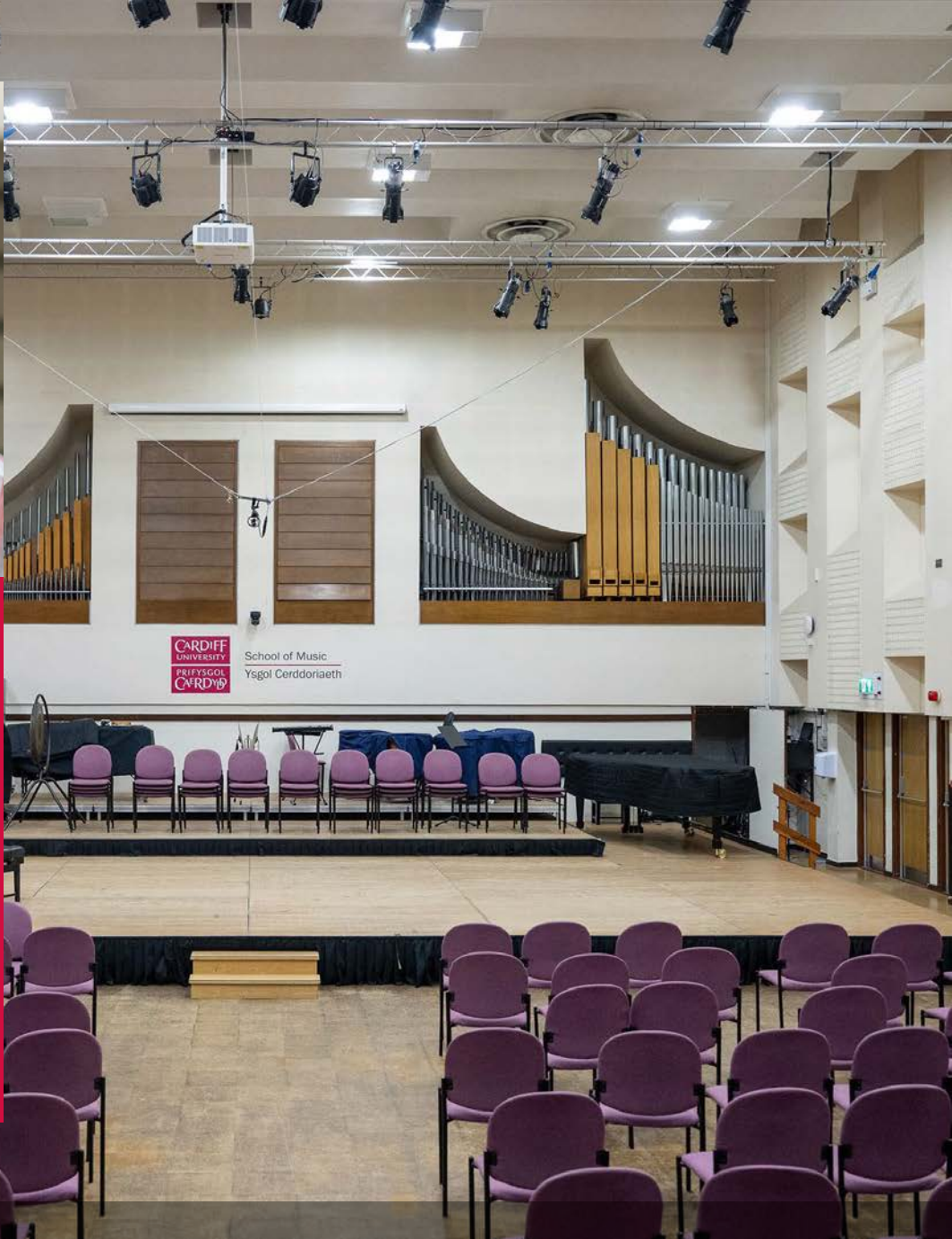
The Concert Hall at the School of Music