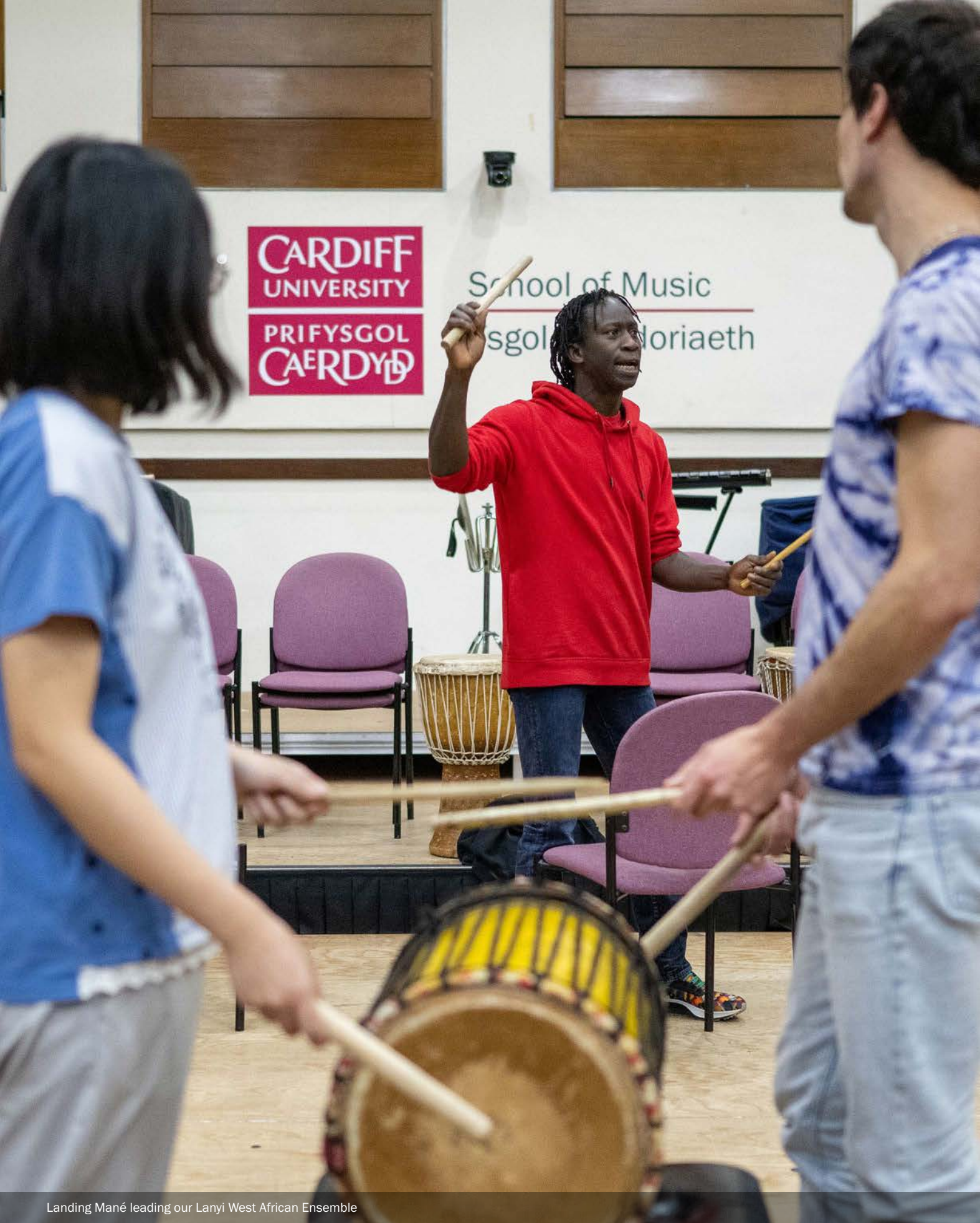
Landing Mané leading our Lanyi West African Ensemble