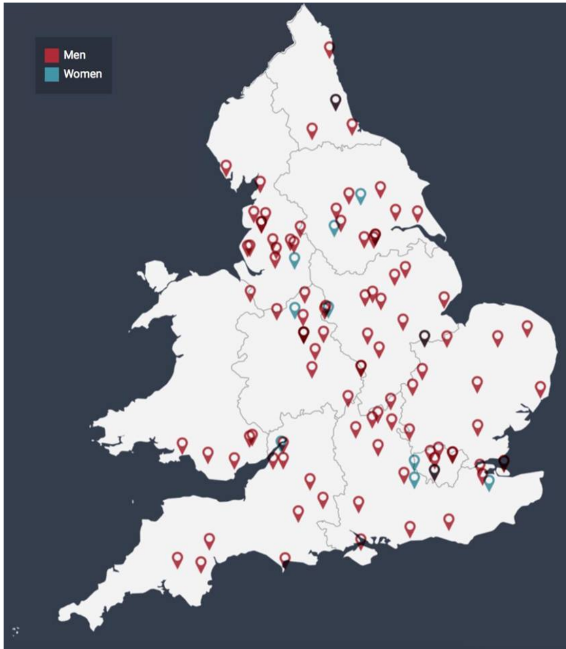
FIGURE I: THE DISPERSAL OF WELSH PRISONERS IN ENGLAND AND WALES