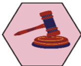
Procurement Act 2023

The development of this policy has considered the strategic objective of the University as well as the growing number of regulatory and policy requirements. For instance, the Procurement Act 2023, Wales Procurement Policy Statement, the Wellbeing of Future Generations (Wales) Act 2015, the UN Sustainable Development Goals, our Environmental Management System certified to ISO 14001:2015, the Social Partnership and Public Procurement (Wales) Act 2023 and Cardiff University’s Procurement Policy and Guidelines . These, and more, inform and impact the manner in which the University manages its procurement activity.