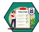
Cardiff University’s Procurement Policy and Guidance.