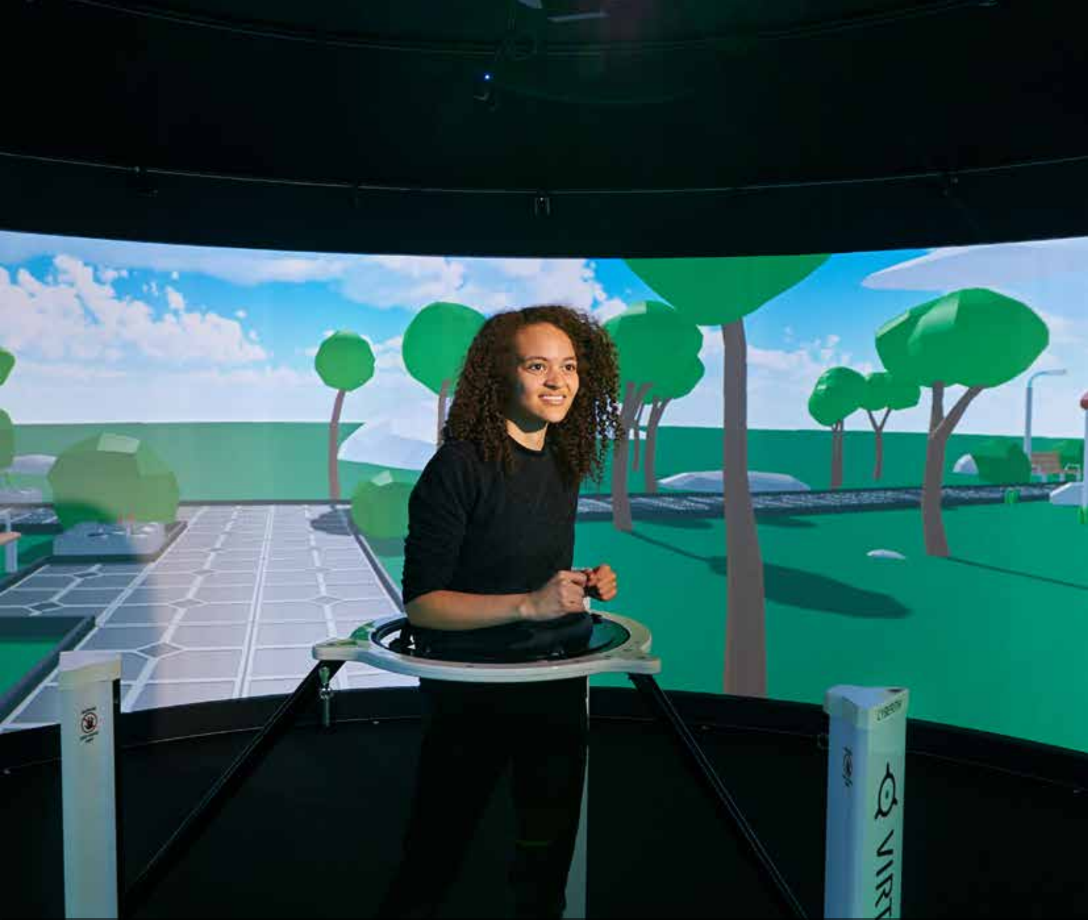
A student taking part in an experiment in our Igloo immersive dome that enables video and programmed simulation scenarios