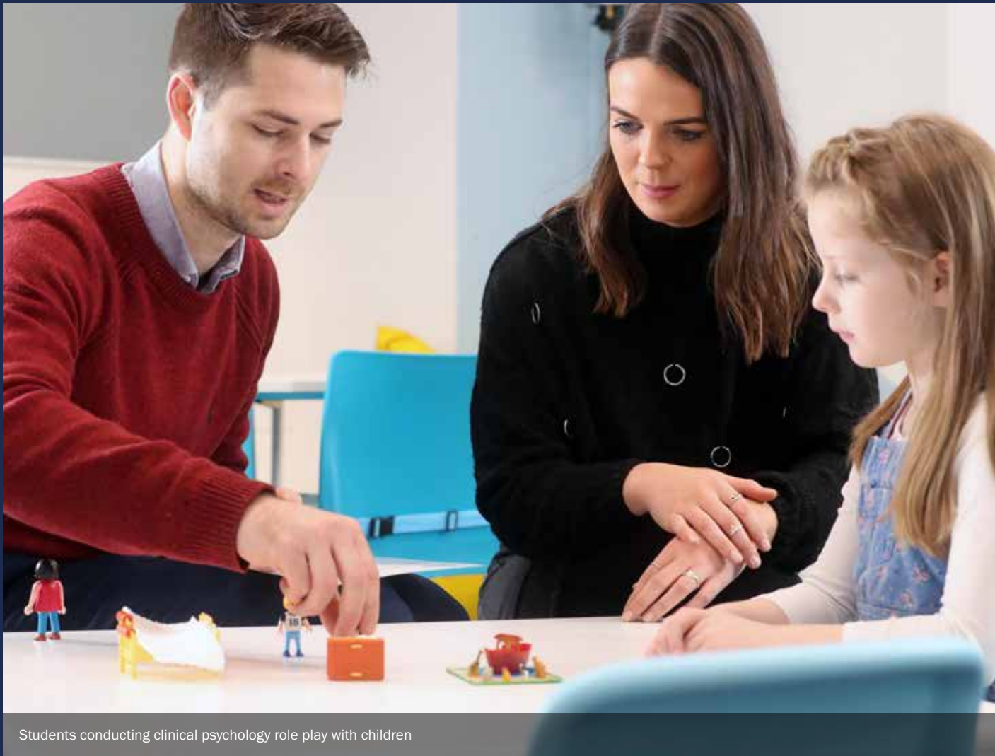
Students conducting clinical psychology role play with children

Explore the different career options available to you as a psychology graduate in our Psychology Careers playlist on YouTube.