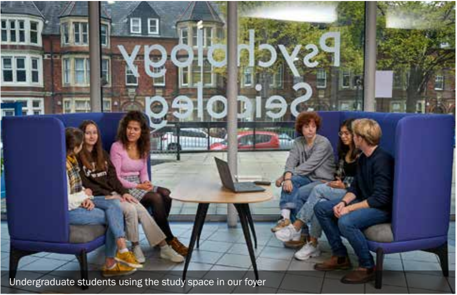
Undergraduate students using the study space in our foyer