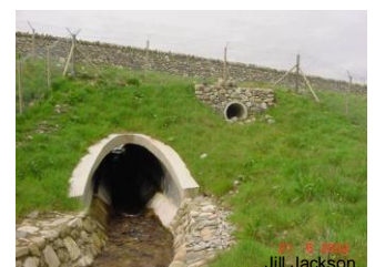
Dry culvert for wildlife passage