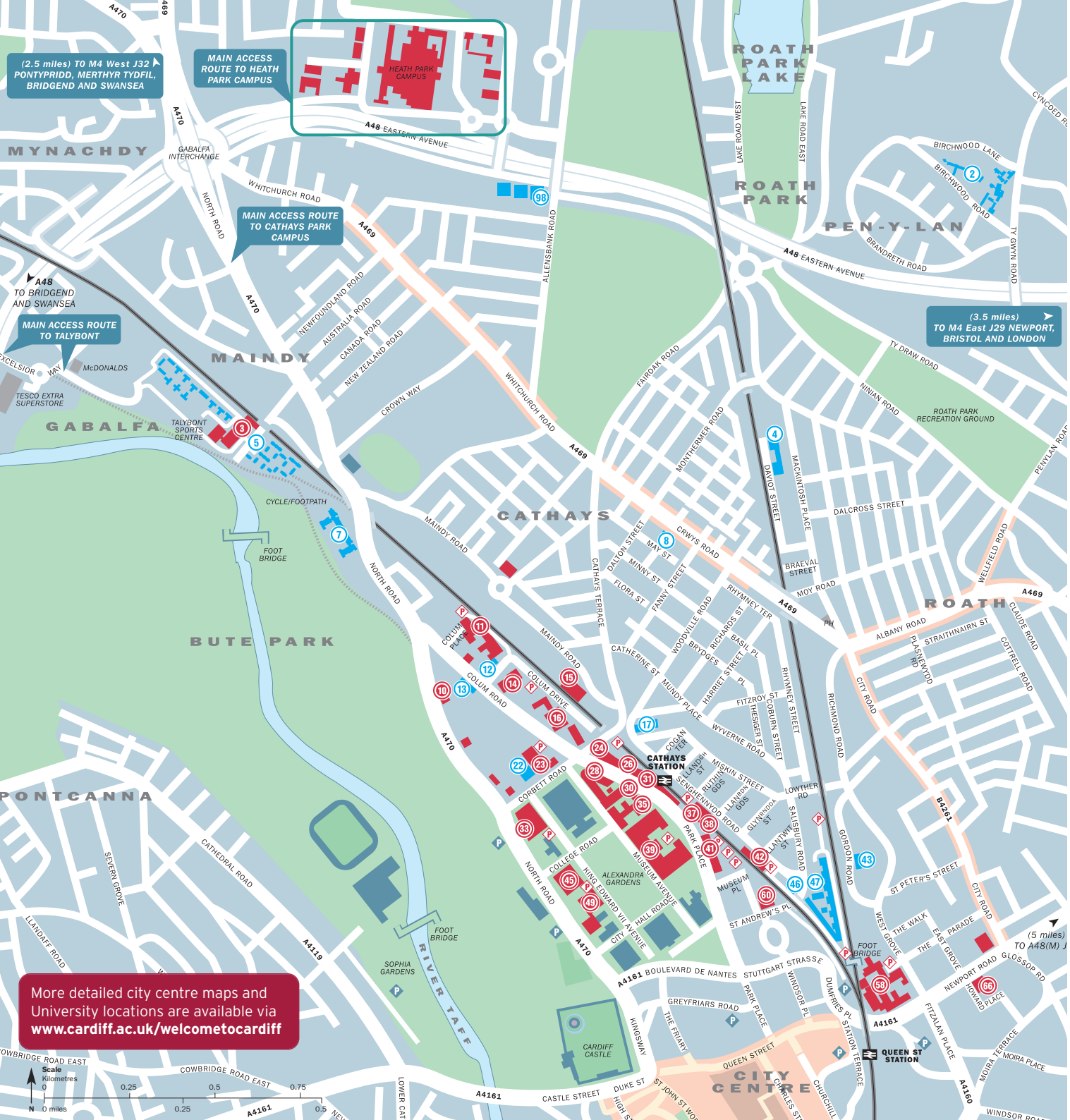
Cathays Park Campus (main map, left) Heath Park Campus (below)