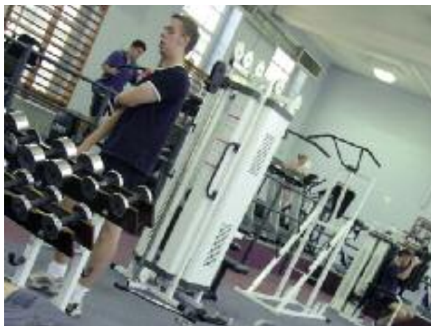
The University has three sports centres