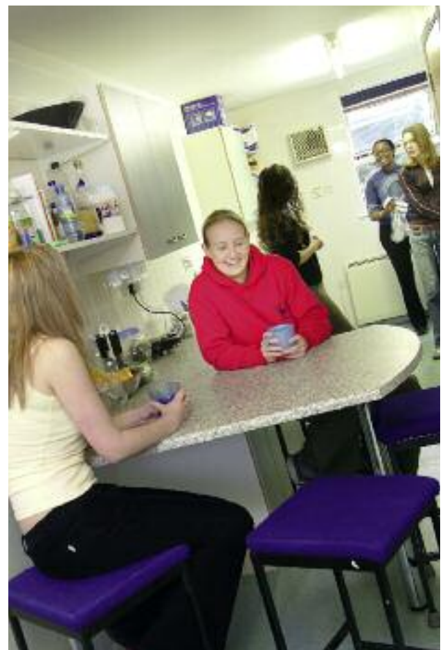
There is a range of catered and self-catered accommodation available