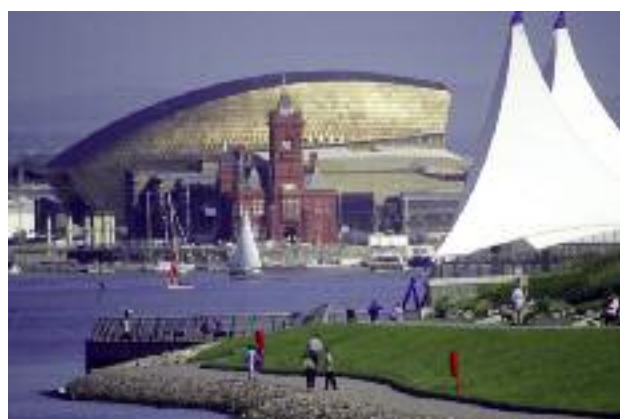
Cardiff Bay, the city's waterfront