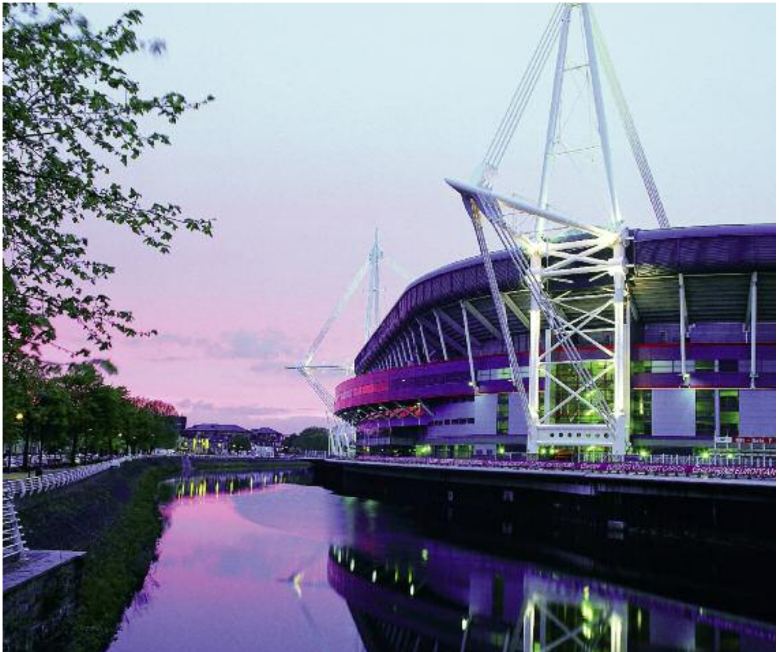
The Millennium Stadium

Culturally, Cardiff is well catered for, with the National Museum and Gallery of Wales, several theatres covering a wide range of tastes and the historic Cardiff Castle. The city also boasts a vibrant shopping centre, numerous cinemas and restaurants, great pubs and music venues. The development of Cardiff Bay is a major attraction and is home to the Welsh Assembly and the newly-opened Wales Millennium Centre.