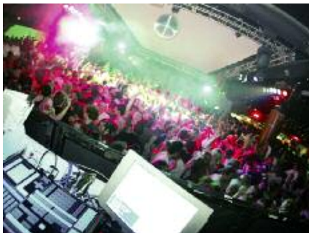
Solus nightclub, the Union's state-of-the-art nightclub

'Studying for my BSc in Chemistry at Cardiff University was a challenging but rewarding experience. The wide range of modules gave me a broad understanding of the subject, as well as plenty of opportunities to focus on the aspects which were of particular interest to me. The approachability of staff and the extensive selection of books in the library meant that help was always readily available. Having thoroughly enjoyed my undergraduate course, I decided to remain in Cardiff to further pursue my studies in Chemistry.'