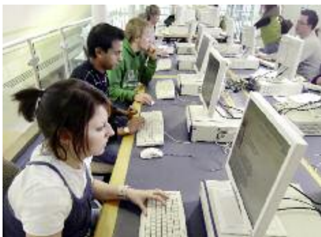
Students have access to the latest IT facilities