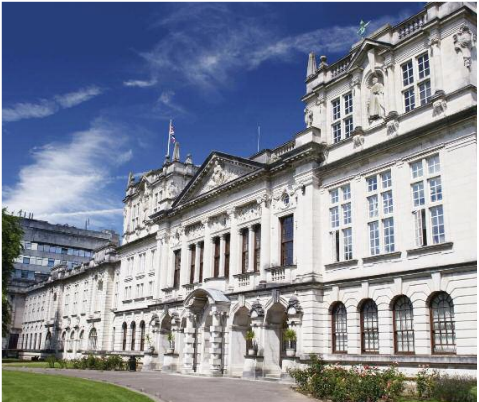
The University's Main Building

The University has an outstanding location amidst the parks, Portland stone buildings and tree-lined avenues that form the city's elegant civic centre. Unusually for a civic university, most of the University's student residential accommodation is within easy walking distance of lecture theatres, libraries and the Students' Union, saving you time and money. More than £150 million has been invested in the university estate since 2002 to provide new and refurbished facilities of the highest quality.