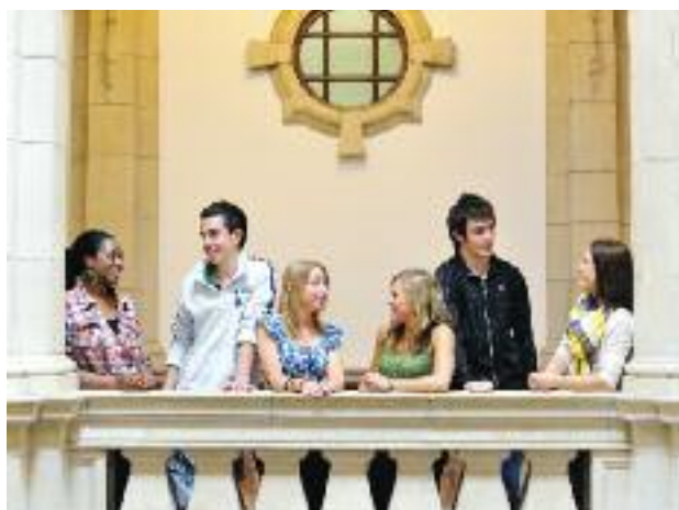
Cardiff has a relaxed and friendly atmosphere