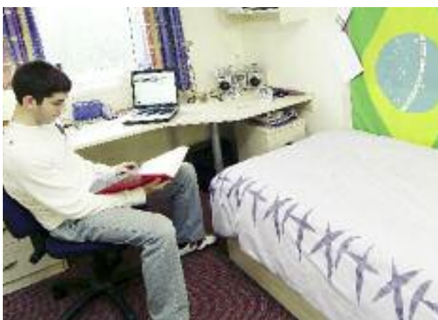
A typical study bedroom