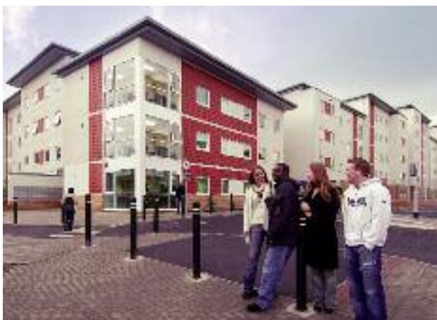
Talybont Court, the University's newest residence