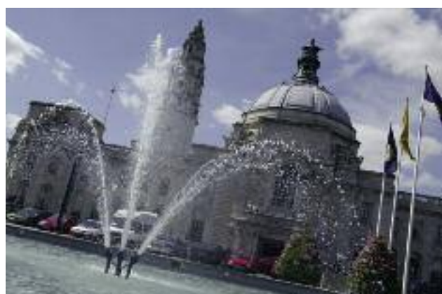
Cardiff's Civic Centre, home to the University

Cardiff benefits from excellent road and rail links with Britain's other major towns and cities. London, for example, is two hours by train, and the M4 links both the west and south of England, as well as west Wales. Travel to the Midlands and the North is equally convenient. The journey by road from Birmingham, for example, takes only two hours. The main coach and railway stations are both centrally placed and Cardiff also benefits from an international airport.