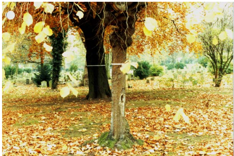
Swan Hung Hotz, Rings around the Trees , 1991, Willesden Lane Cemetery

In this three-week exercise, the project aims to highlight the aesthetic aspect of design with the belief that Architecture, whether it is a utilitarian craft or not, must be aesthetic or else fail completely . By aesthetic, it means beyond the purely physical effect of sensations so that the superficial impression of form in space develops into a complex experience with inner resonance. (Kandinsky, Concerning the Spiritual in Art )