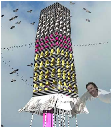
Will Alsop Proposal

According to the British Trust for Ornithology "the natural nest sites on which many bird species depend, such as holes in trees and buildings, are fast disappearing as gardens and woods are 'tidied' and old houses are repaired" In response to this the BBC Radio 4 Today programme commissioned designs for bird boxes from Architects Sunand Prasad and Will Alsop. There are standard designs for bird houses, but Today asked what Architects might add to the designs.