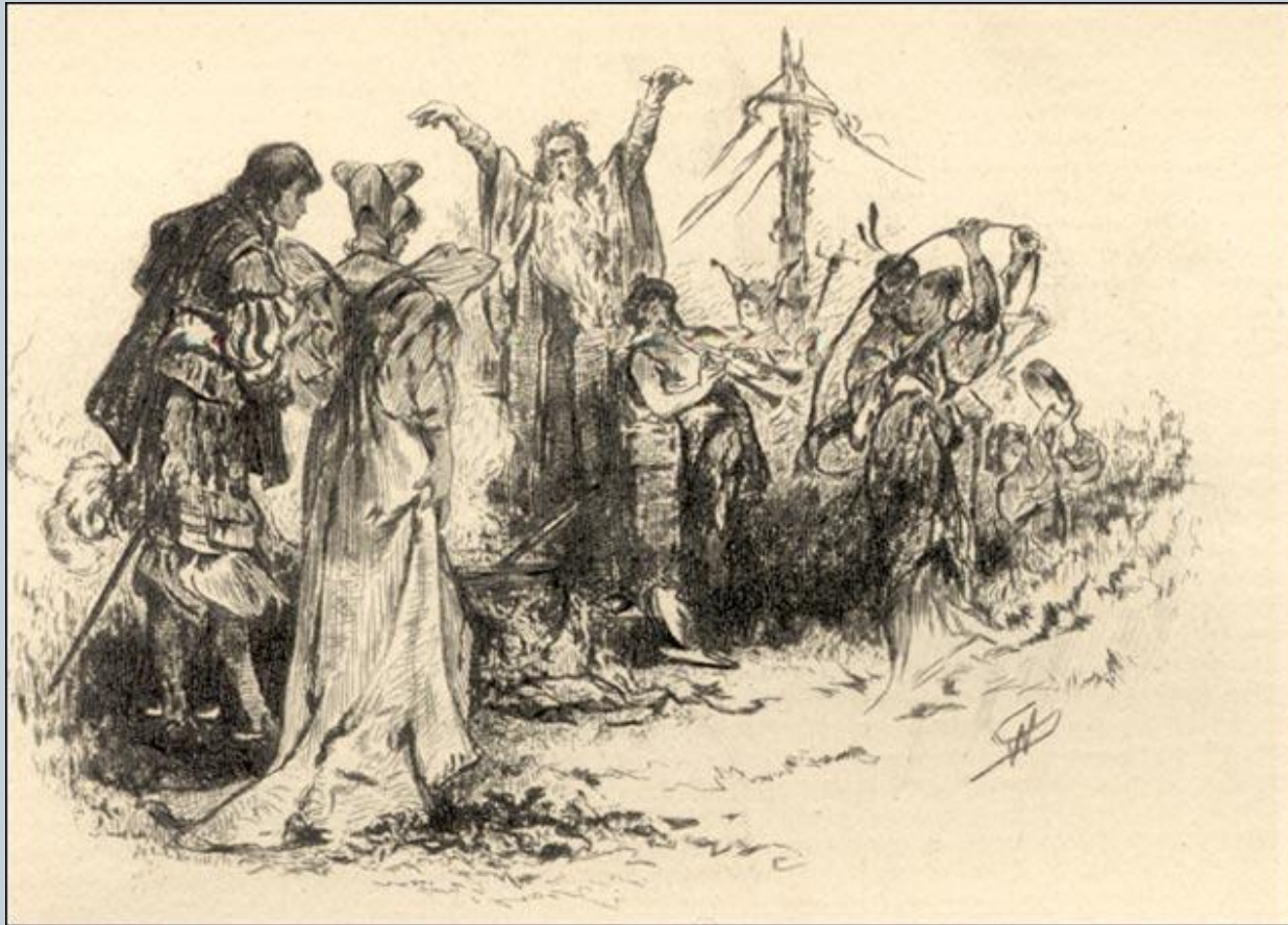
Illustration to Nathaniel Hawthorne's short story "The Maypole Lovers of Merry Mount" (1836)