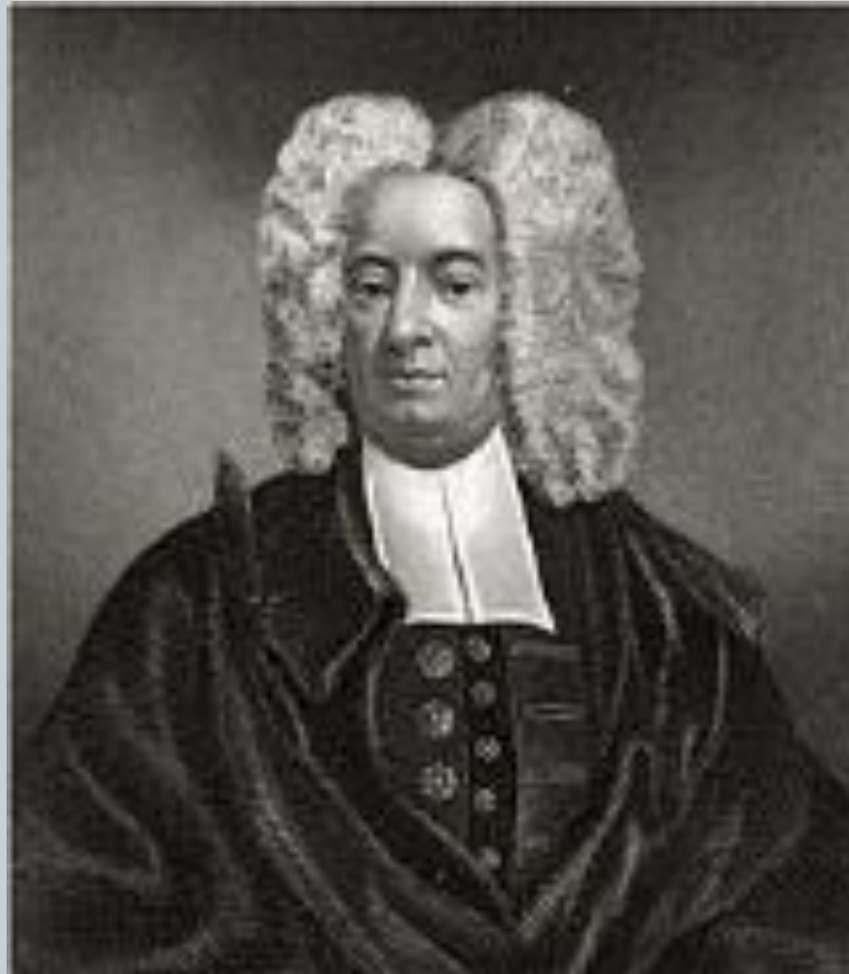
Peter Pelham, Cotton Mather (c. 1700), engraving, American Antiquarian Society, Worcester, Massachusetts, USA.